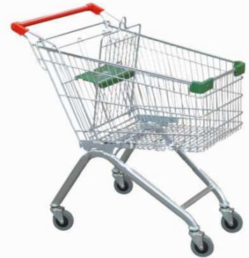
WONT Mall Cart (Zinc / SS) Model : W-MC