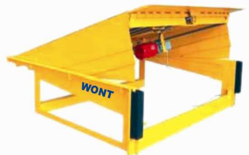
WONT Hyd. AC Dock Leveler Model : W-HADL Capacity : 8.0 / 10.0 TON Lift Height : Up 350 mm / Down 250 mm