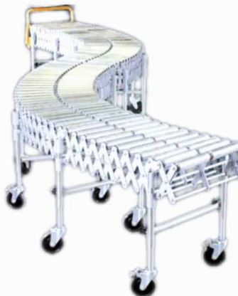
WONT Portable Conveyor Model : W-JSCIA