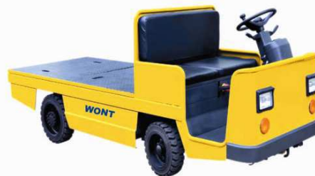
WONT Electric Tow Truck Model : W-NBD Capacity : 2.0 / 3.0 TON