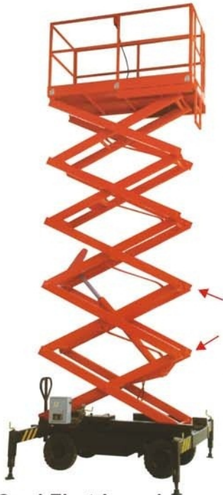
Semi-Electric work platform