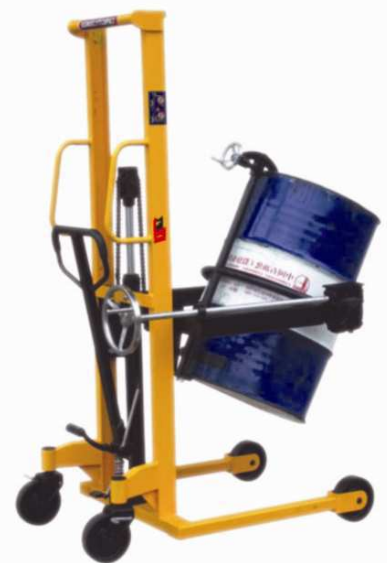
WONT Hyd. Drum Lifter Cum Tilter Model : W-HDLCT Capacity : 400 Kg. Lift Height : 1.5 / 2.0 / 2.5 / 3.0 mtr.