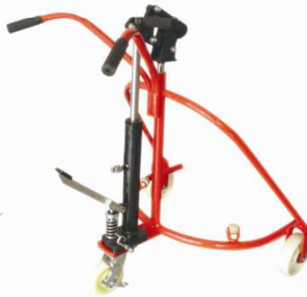
WONT Hyd. Drum Lifter Auto Gripper Model : W-HDLMG Capacity : 400 Kg.