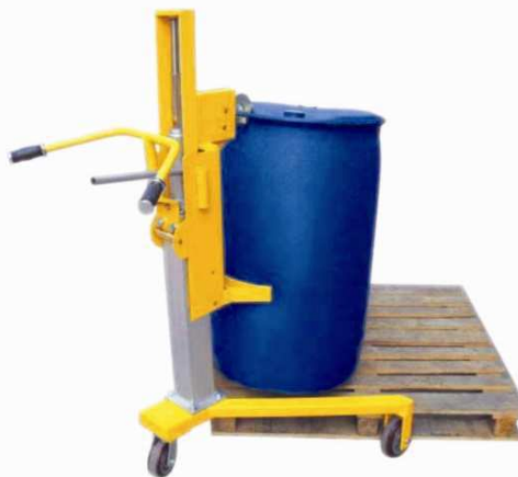
WONT Hyd. Drum Pallet Stacker Model : W-HDPS Capacity : 400 Kg. Lift Height : 200 mm