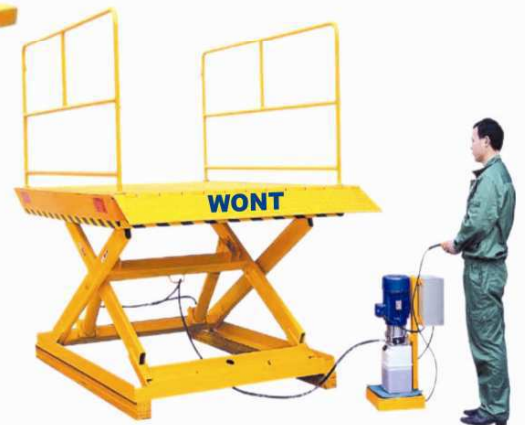
WONT Hyd. AC / DC Scissor Table Model : W-HST Capacity : Upto 6000 Kg. Lift Height : Upto 6.0 mtr.