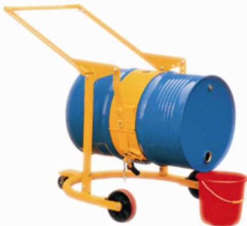
WONT Mech. Drum Tilter Model : W-MDT Capacity : 300 Kg. Lift Height : 450 mm