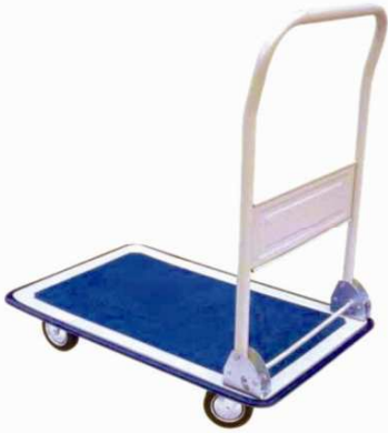
WONT Platform Trolley Model : W-PT Capacity : 150 / 300 Kg.