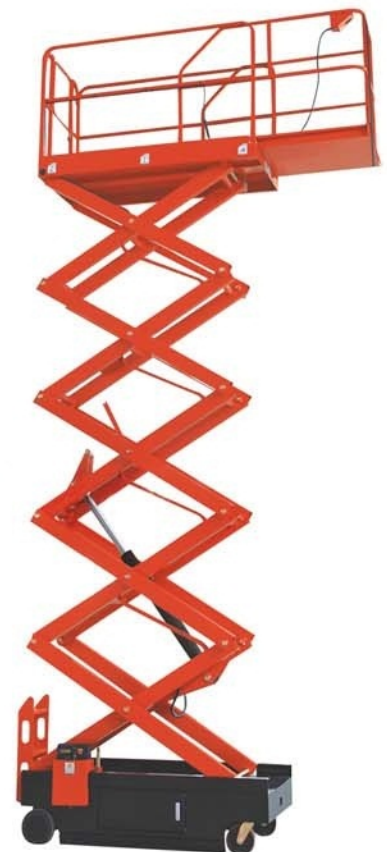
Self-propelled work platform