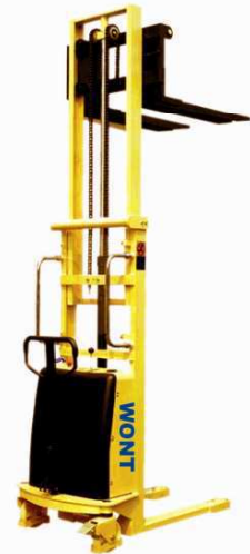
WONT Hyd. Semi Electrics Stacker Model : W-SES 10 Capacity : 1000 Lift Height : 1.5 / 2.5 / 3.0 mtr. Overall Width : 570 / 640 Fork Length : 900 / 1150