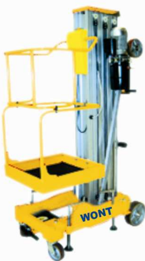
WONT Single Mast Aerial Platform Model : W-SMAP Capacity : 125 Kg. Lift Height : 8.0 / 10.0 mtr.