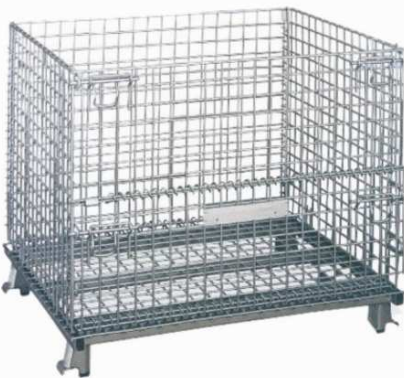
WONT Storage Basket Model : W-NNS Capacity : Upto 1500 Kg.