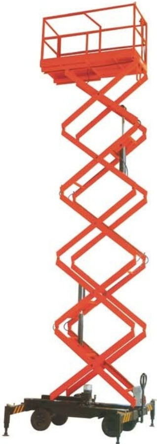
Semi-Electric work platform

● Latest link structure design, greatly enhancing stability.