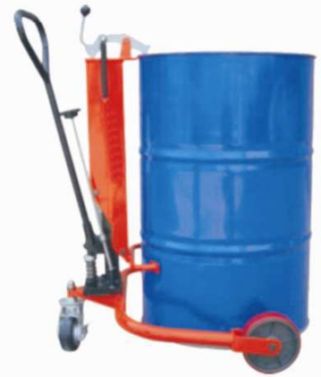
WONT Hyd. Drum Lifter Mech Gripper Model : W-HDLAG Capacity : 400 Kg.