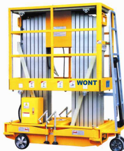
WONT Double Mast Aerial Platform Model : W-DMAP Capacity : 300 Kg. Lift Height : 8.0 / 10.0 mtr.