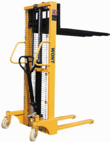
WONT Hyd. Stacker Model : W-HS 10 / 15 Capacity : 1500 / 1000 Lift Height : 1.5 / 2.5 / 3.0 mtr. Overall Width : 740 / 550 Fork Length : 900 / 1150