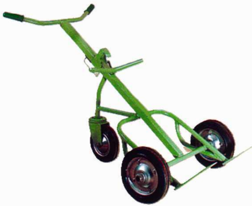
WONT 3 Wheel Drum Carrier Model : W-WDC Capacity : 300 KG.