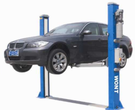
WONT Electrical Car Release Base Lift Model : W-ECRBL Capacity : Upto 3.0 TON