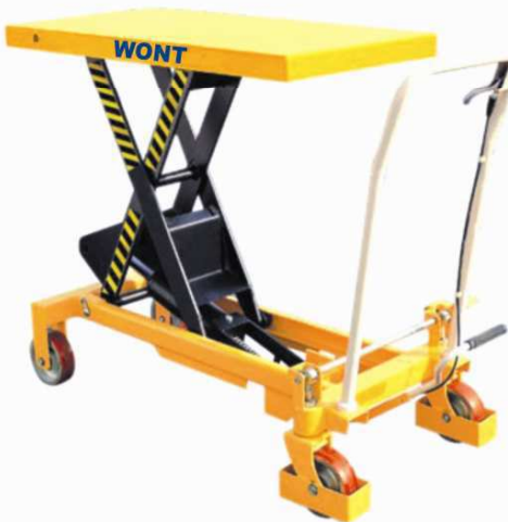
WONT Hyd. Scissor Table Model : W-HST 30 / 50 / 75 / 100 Capacity : 300 / 500 / 750 / 1000 Kg.