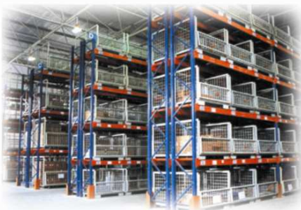
WONT Heavy Duty Racking Model : W-JL-BM Capacity : Upto 3.0 TON / Layer