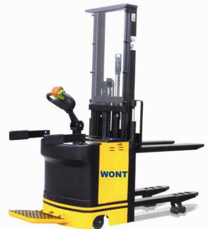
WONT Hyd. B.P. Double Pallet Lifting Stacker Model : W-HBPDPLS 10 / 15 Capacity : 1000 / 1500 Lift Height : Upto 3500 mm Overall Width : 780 Fork Length : 830