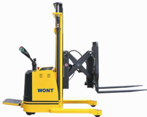
WONT Hyd. Electric Reach Stacker Model : W-HERS 10 / 12 / 15 Capacity : 1000 / 1250 / 1500 Lift Height : 2.0 / 3.0 / 4.0 / 5.0 / 5.5 mtr. Overall Width : 1100 / 1200 Fork Length : 950 / 1150