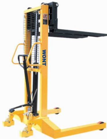
WONT Hyd. Wide Stacker Model : W-HWS 10 Capacity : 1000 Lift Height : 1.5 / 2.5 mtr. Overall Width : 740 / 550 Fork Length : 900 / 1150