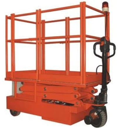
Self-propelled work platform