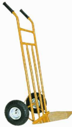
WONT Sack Truck Model : W-ST Capacity : 250 Kg.