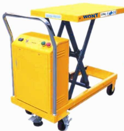
WONT Electric Scissor Table Model : W-EST Capacity : 300 / 500 Kg.