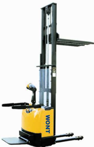
WONT Hyd. Fully Electric Stacker Model : W-HFES 1216/1230/1232/1236 Capacity : 1000 / 1500 Lift Height : 2800 / 3200 / 3600 / 4000 / 4600 Overall Width : 890 Fork Length : 900 / 1150